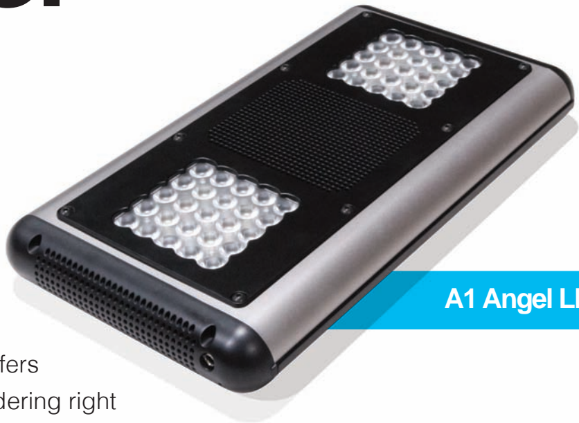
A1 Angel LED

The A1 Angel LED aquarium light is perfect for standard, shallow and frag reef tanks, and offers full-spectrum output and color rendering right out of the box. It's the complete package... in a cool titanium-colored case.